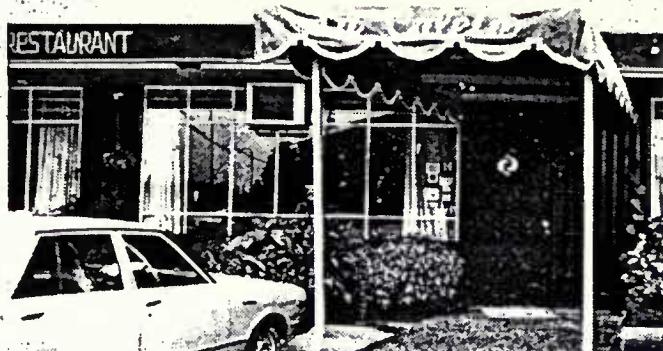
CENTRO gastronómico especializado en mariscos y pescados.

Se aceptan Diners y demás tarjetas de crédito.