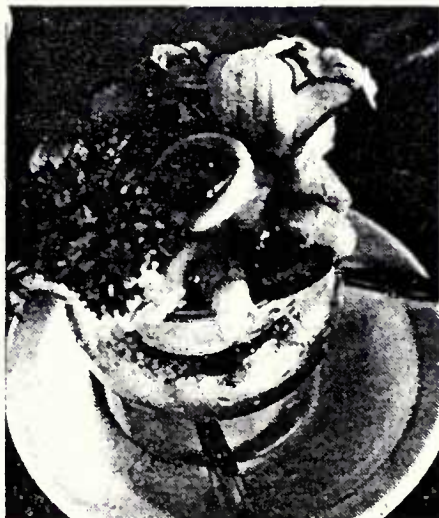
PLATOS exquisitos para el buen paladar