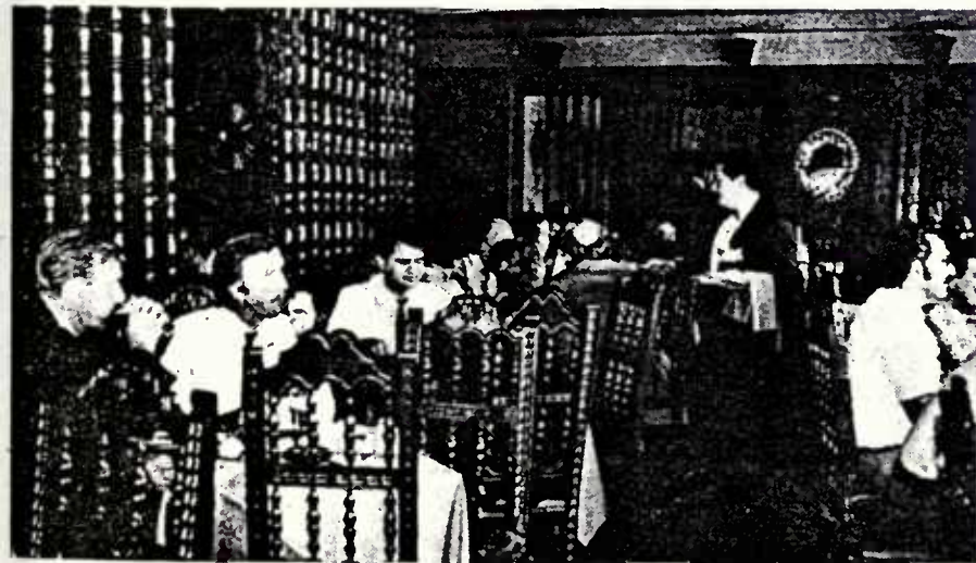
FINA atención y ambientes cómodos para que el cliente disfrute un buen momento.

Un cliente que se siente muy bien atendido en "La Caleta", con muy buena cocina y un ambiente de comodidad, que han convertido a este restaurante en uno de los mejores de Lima. ■