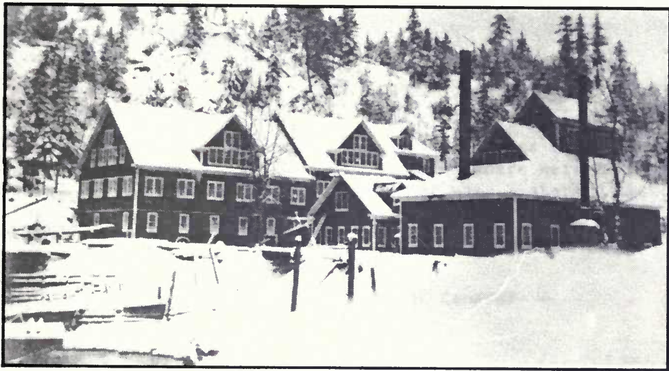
Bluebell gravity mill, machine shop, compressor house. Designed by S. S. Fowler. Note ample windows rare at that time. Circa 1908.