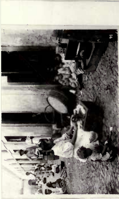
"In the crowded cities the poor families have usually only one room. Life is lived in the street." V8