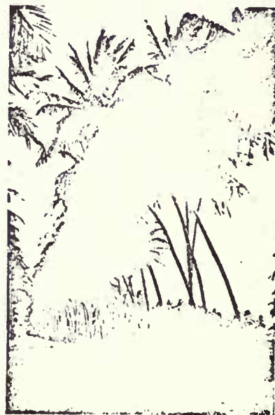
The splendid military road

The status of Porto Rico is different from that of these other islands. Hawaii as a Territory has a definite place in our political scheme but Porto Rico, like the Philippines, is only a possession; but, unlike the Philippines, to whom eventual independence has been held out, our policy toward Porto Rico—undefined in many respects—has never admitted independence as a possibility. Congress has been vague in stating what position Porto Rico should occupy in the nation, and this vagueness has made the question of status a political football. Until 1917 the Porto Ricans hung between heaven and earth, belonging to