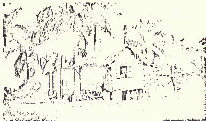
A typical house in Porto Rico towns