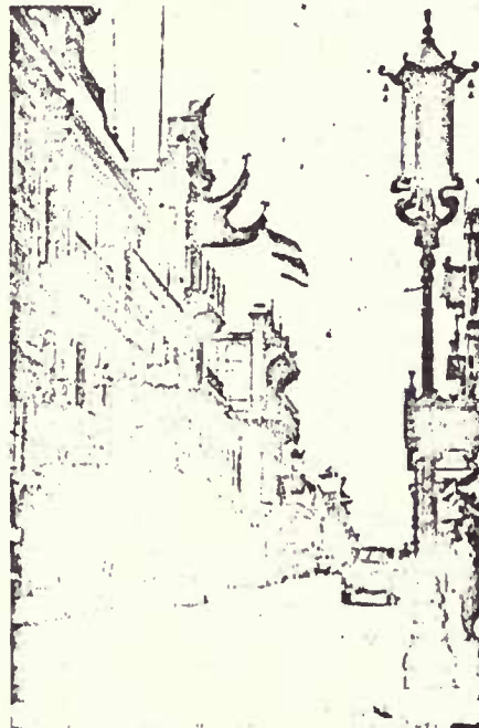
San Francisco's Chinatown is the largest and oldest Chinese colony in America

No more wives were allowed to sail from China. Of those held in detention the Chinese branch of the Native Sons came to the rescue with attorneys and at last secured permission for them to join their husbands for three months, under bond, while the cases could be tested in the courts. No one in the Chinese colony could believe that Congress had intended to take away from citizens the possibility of having their wives live with them, but as the months dragged by, punctuated by conflicting decisions, they began to doubt. In three districts the judges ruled that wives of citizens must be admissible, but in other districts the judges ruled adversely. The three months passed, but amid scenes of