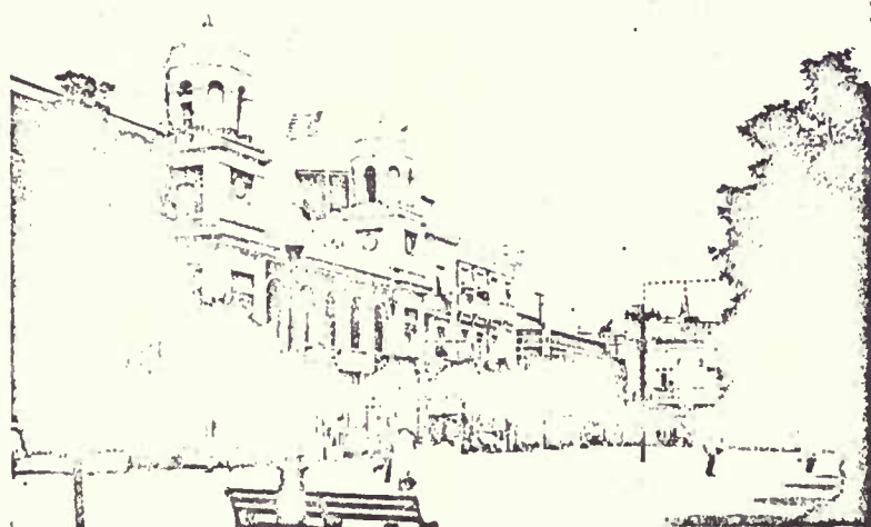
The Public Square in San Juan, showing a city government building