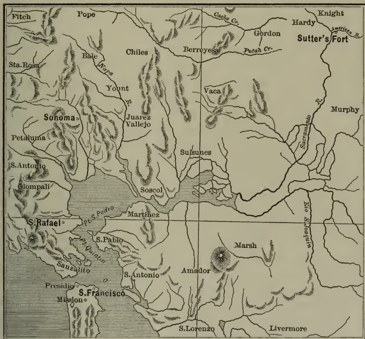
REGION NORTH OF BAY.

a sample of what could be done, so as in the main to avoid bloodshed, could not be effectual unless the enemy were allowed an advantage of five to one; and even then a retreat must be feigned!" Soon it was learned that Todd also had been captured through the treachery of a guide employed to conduct him to the coast. 11 Ford tells us, being confirmed in this particular by Carrillo's testimony already cited, that two