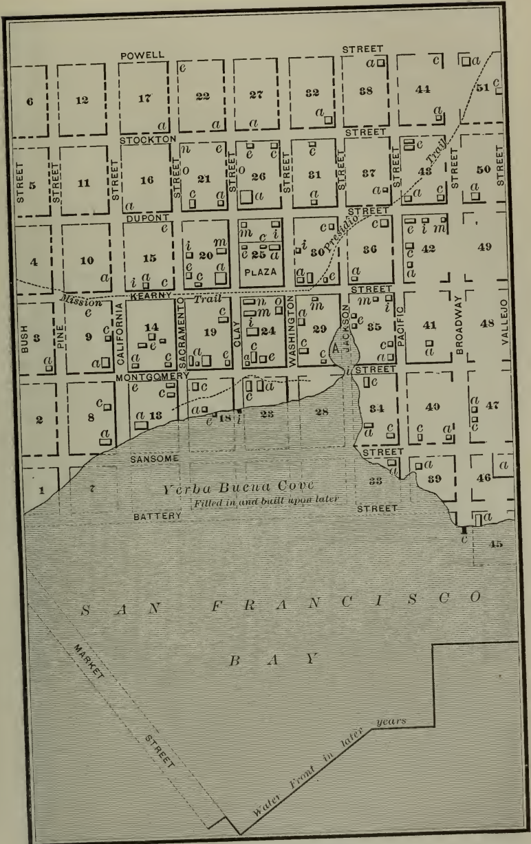
SAN FRANCISCO IN 1848.