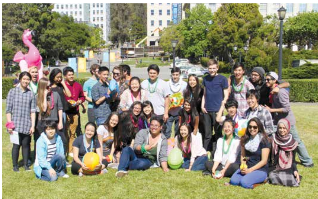
A snapshot from one of the annual gatherings that celebrate the student employees who keep many of the Library's day-to-day operations humming.