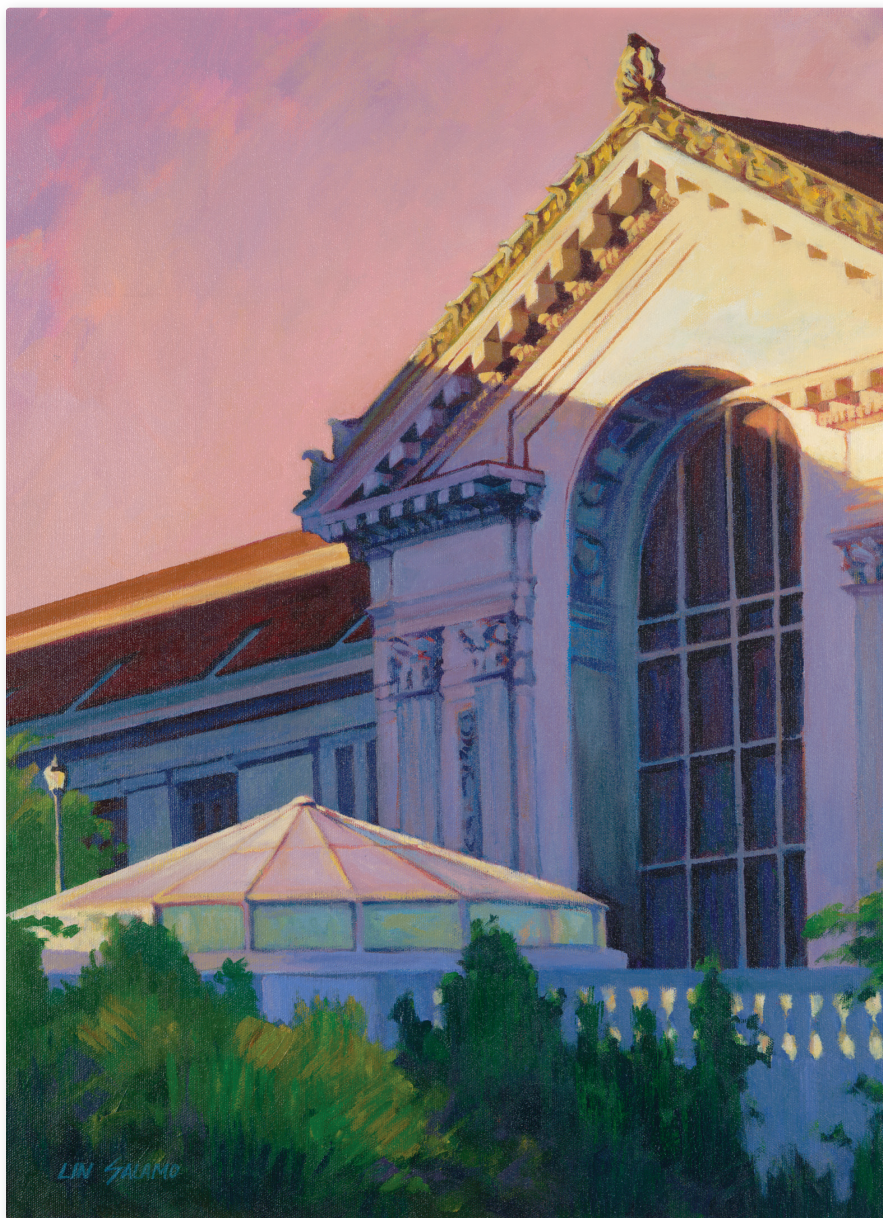
Doe Library (detail), by Lin Salamo

What can we learn about the library through the eyes of artists? In this selection, artists from on and off campus offer a variety of intimate and imposing depictions of Doe Library.