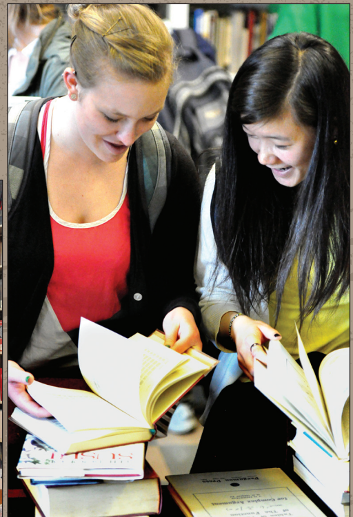
Visitors thronged to a book giveaway on the third floor, where duplicate titles on virtually every subject collected by the Library lined the shelves. About two thousand books found happy new owners.