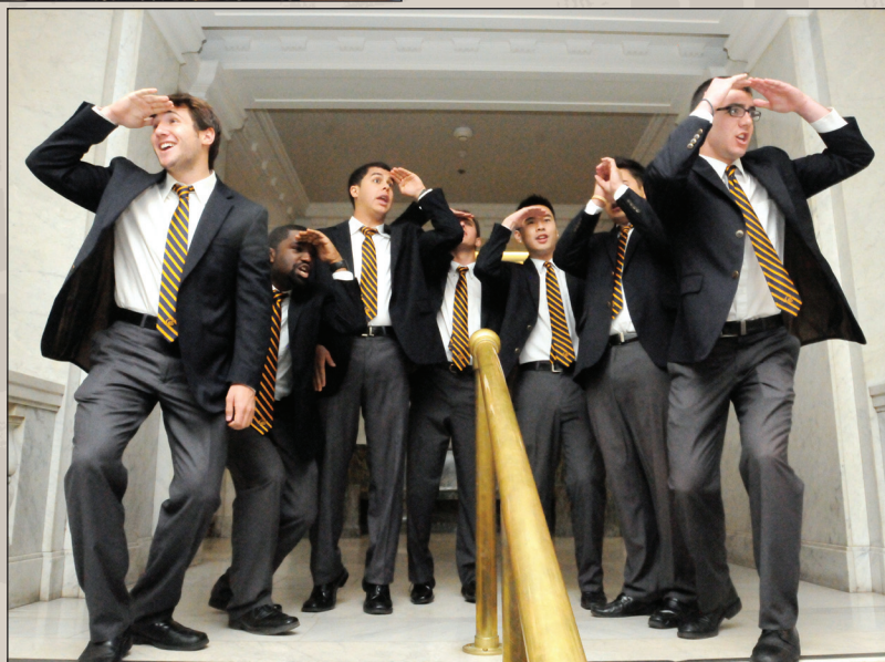
The Men's Octet delivered a rousing performance on the steps of the Bernice Layne Brown Gallery.