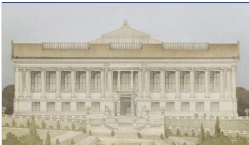
Charles Franklin Doe Memorial Library Building, drawing on paper by John Galen Howard, 1907.