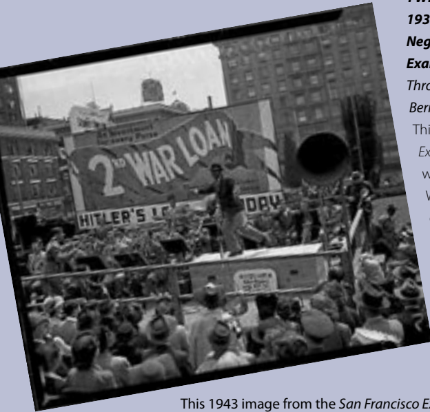
This 1943 image from the San Francisco Examiner archives shows a War Bond drive, with Bill "Bojangles" Robinson dancing atop a coffin for Hitler.