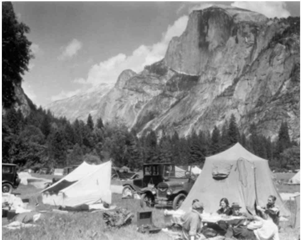
"Overflow crowd of campers in Stoneman Meadow," with Half Dome in the background. From a 1915 manuscript on the Environmental Effects of Tourism at Yosemite National Park.