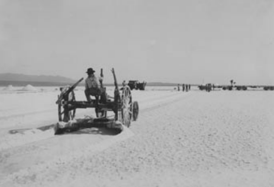
Plowing salt at Salton, from Photographs of the Southern Pacific Route, 1894 (Bancroft Library)

UNDERGRADS CITE "LEARNING HOW TO LEARN" AS A REWARD OF LIBRARY RESEARCH