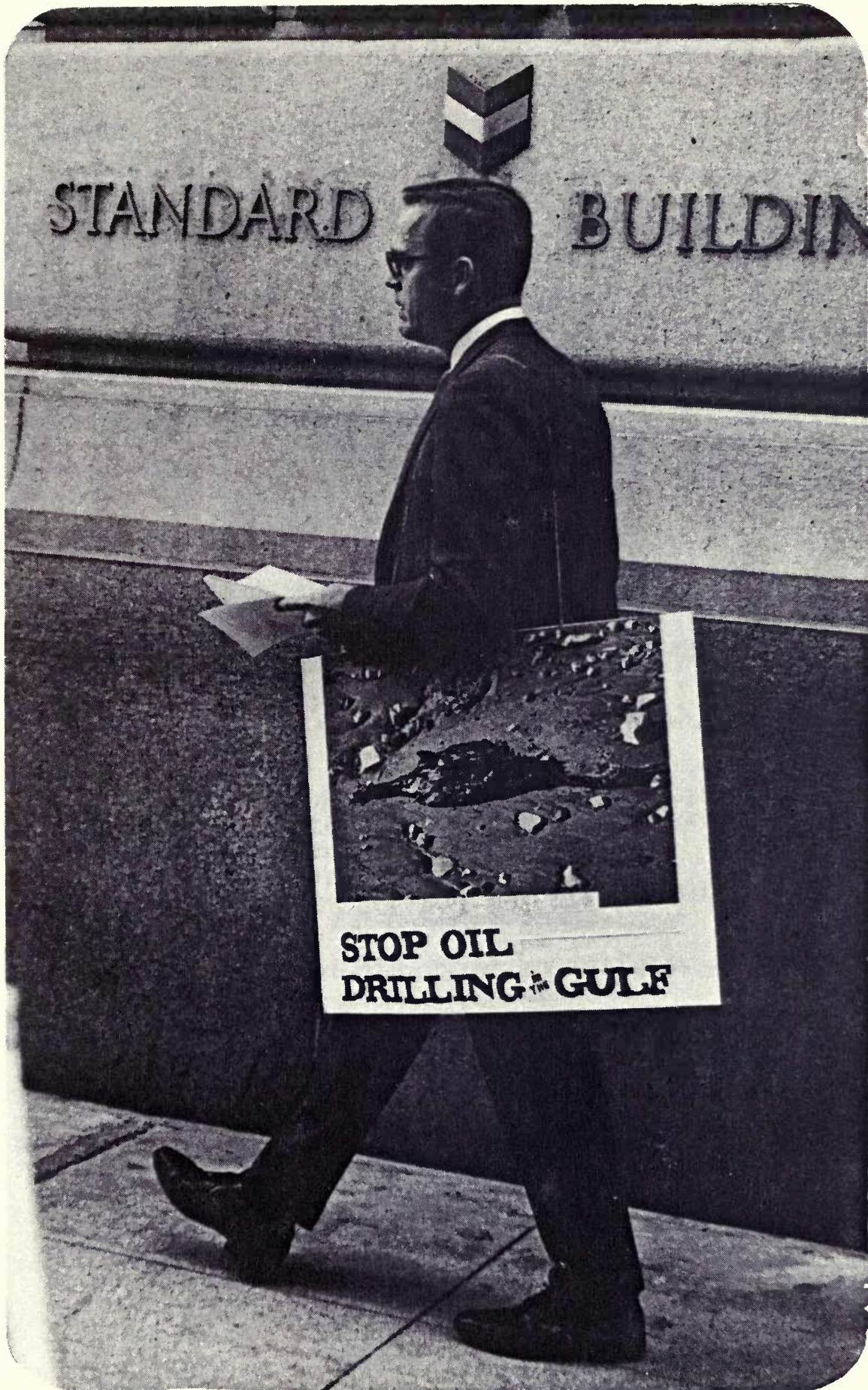
Picketing Standard Oil as Sierra Club President, 1970