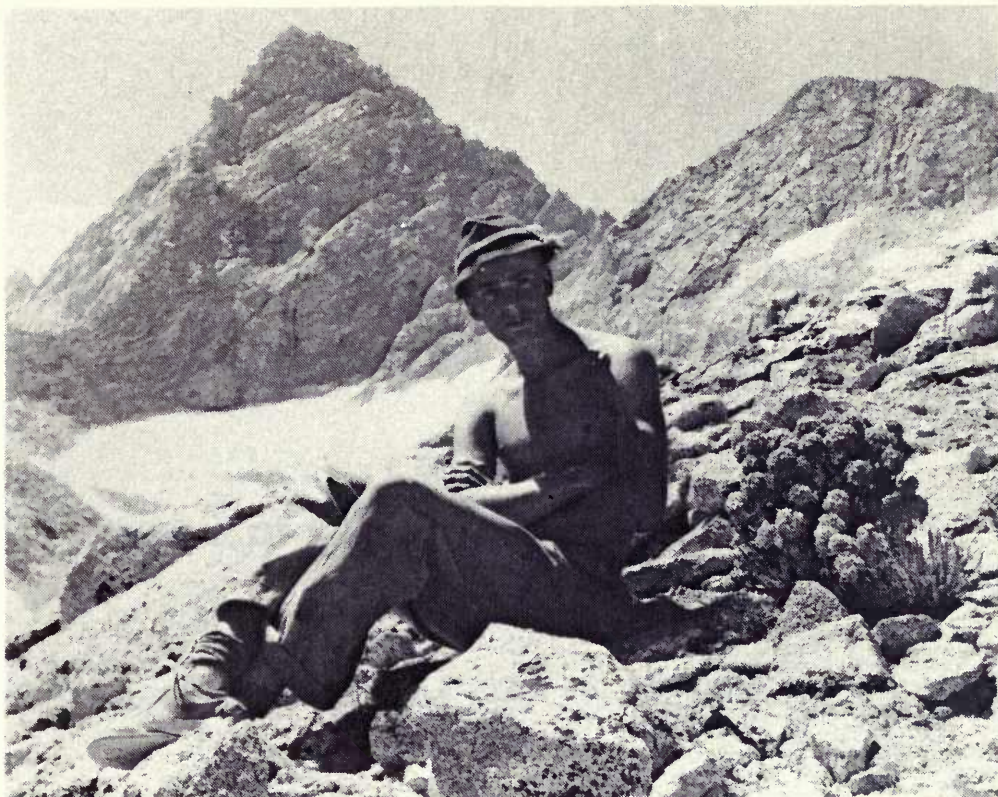
Sierra Club High Trip, mid 1950s