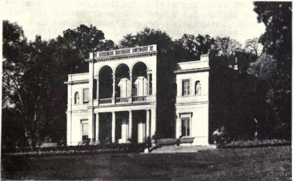
HEADQUARTERS, WORLD WOMAN'S PARTY Geneva, Switzerland