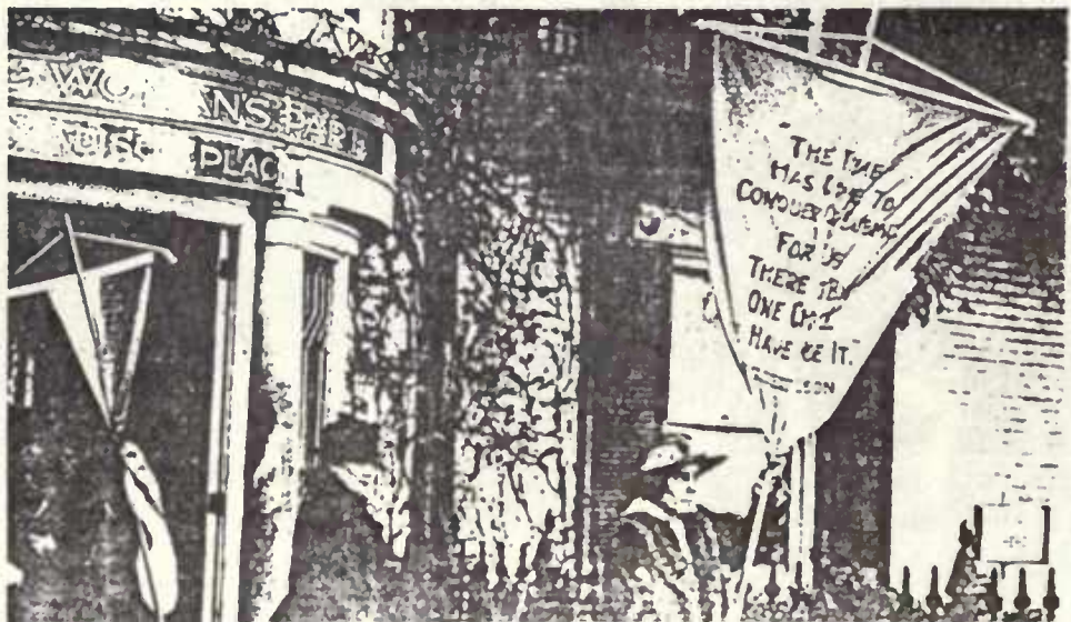
Off to the fray, a grim Alice leads suffragists from headquarters.

The Alva Belmont House, where Miss Paul spends much of her time, seems to have had its character molded by her single-minded intensity, perhaps fittingly, since she has saved the house from government plans to raze it for a parking lot. Although the years have taken their toll on the house (one of the oldest on Capitol Hill), there is a grandeur about it and its handsome antiques, many of which are directly related to the women's movement. Here stands Susan B. Anthony's desk, Elizabeth Cady Stanton's chair. Paintings and busts of suffragists line a front hall lit by a red-and-gold Victorian fanlight. At the far end, a purple-and-gold banner demands suffrage for the women of the United States.