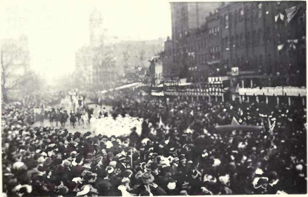
NAWSA CONGRESSIONAL COMMITTEE'S INAUGURATION PARADE, WASHINGTON, D. C. March 3, 1913