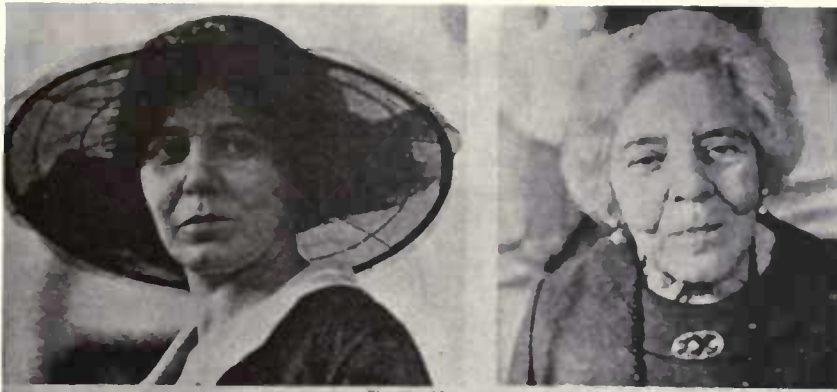
Photoworld Alice Paul in 1917 (left) and today: A lifetime crusade Newspaper Photo - Wallis McNamee