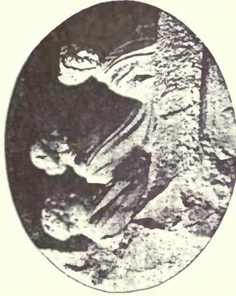
Memorial Statue of Pioneers, Elizabeth Cady Stanton, Susan B. Anthony, and Lucretia Mott, placed by the Woman's Party in the crypt of the National Capitol.

THAT the identity of the wife shall no longer be merged in that of her husband, but the wife shall retain her separate identity after marriage and be able to contract with her husband concerning the marriage relationship.