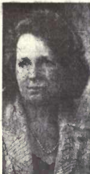
Harris & Ewing

Another measure she backed was the Copeland-Dickstein Bill, which removed sex discrimination in the case of women who marry foreign nationals. One case she cited was that of a Vassar College graduate living in Paris and president of an American club there