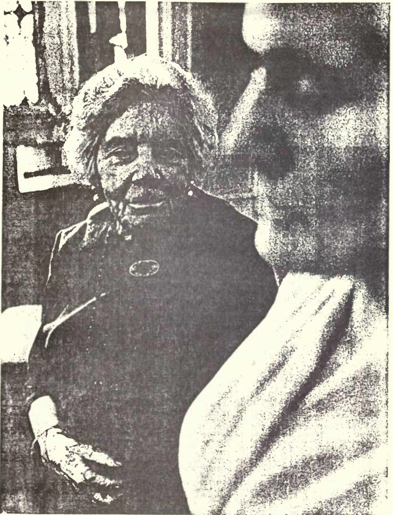
Alice Paul, beside a bust of Susan B. Anthony, is, at 87, still actively involved in women's rights.