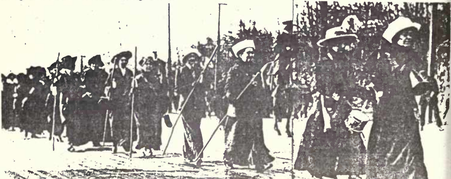
Clad in brown and carrying pilgrim staffs, suffragists march from New York to Washington in 1913.

But the entry of the United States into World War I broke up these patterns and inspired the Woman's Party to militancy. Picketers' slogans became increasingly pointed, increasingly unpatriotic to some eyes. When a Russian delegation visited the White House on June 20, 1917, the pickets carried a banner declaring in