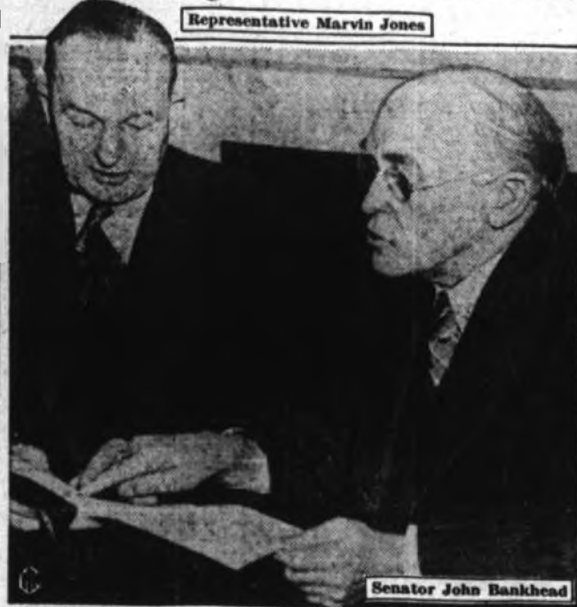
Co-authors of the new tenant farm bill, Representative Marvin Jones, left, of Texas, and Senator John H. Bankhead of Alabama, right, confer on their plan which would authorize an annual appropriation of $50,000,000 for a period of 10 years to enable tenant farmers to purchase their own land.