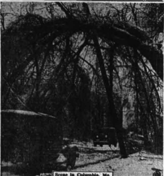
Scene in Columbia, Mo.

Scenes such as this were typical in Missouri and surrounding states after the belated arrival of winter, bringing with it an ice storm described by the U. S. weather bureau as the worst in 17 years. When this huge tree fell during the storm, it came down across a cable, forming an archway over the street in Columbia, Mo.